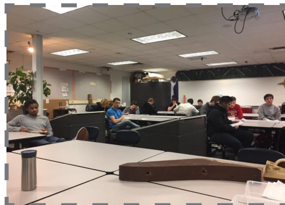
Oakdale Design & Build Presentation Gallery