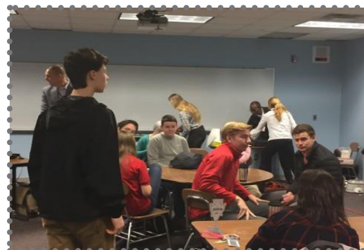
CAPS Breakfast Gallery